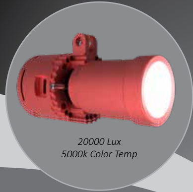
LED Head Light