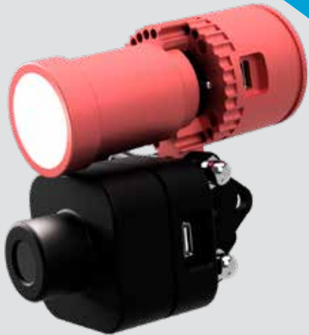
1440p / 9.6 or 15.8mm Lens, Large Depth of Field Anodized Aluminum Case